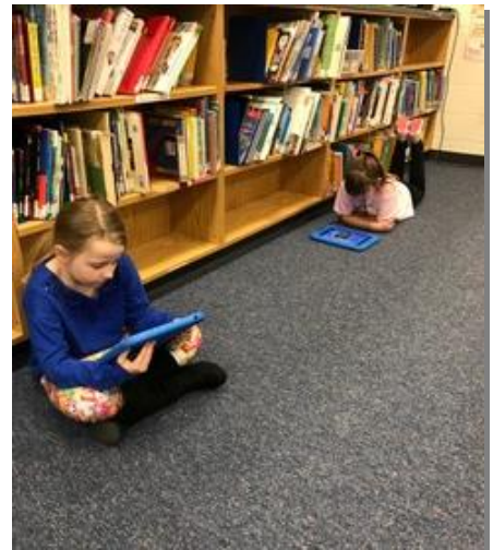
Students reading e-Books using brand new iPads.