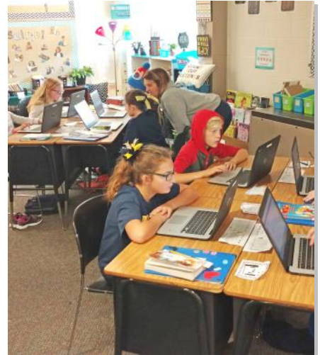
Students use new Chromebooks to work on their papers.

By the 2017-18 school year, with the students being one-to-one across the district, more funding will be available for teaching staff classroom enhancements. This includes the use of interactive TVs/Whiteboards, presentation software, digital microscopes, and more. North Muskegon Public Schools is thankful to the community for their continued support in Education!