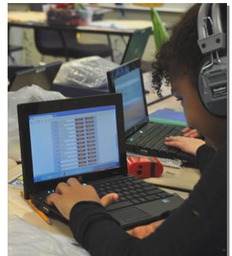
These students are using laptops to take spelling quizzes and type fiction stories.